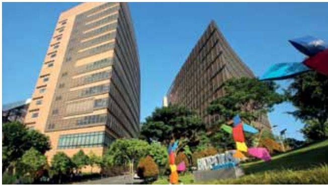
Biopolis and Fusionopolis @ one-north 纬壹科技城-启奥园, 启汇园