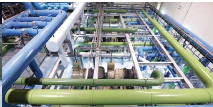
Uninterruptable Service Delivery 不间断的服务