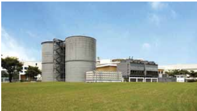
Woodlands Wafer Fab Park 兀兰晶片园