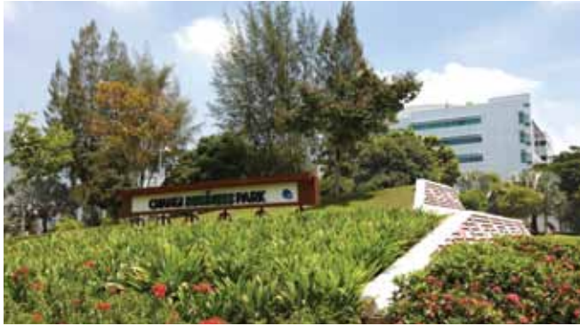
Changi Business Park 樟宜商业园

Keppel DHCS has a robust maintenance programme managed by our team of dedicated trained professionals. We provide round-the-clock, one-stop service technical support to our clients. Keppel DHCS is also ISO 9001, 14001, OHSAS 18001 and SS506-Part 1 certified.